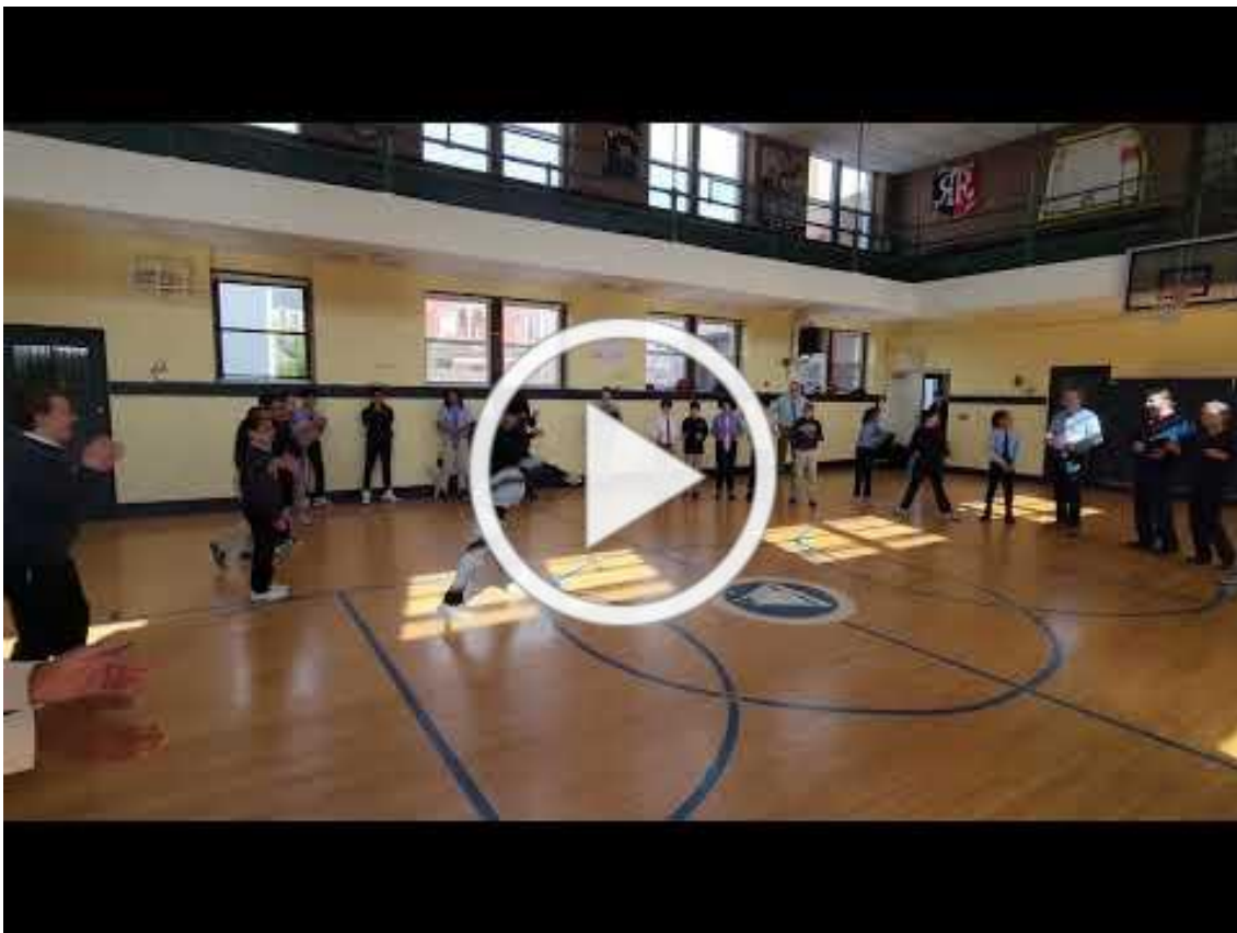
Members of 3rd EyE Youth Empowerment get the boys moving following an explanation of the five pillars of Hip Hop.

Check out more videos from our Guest Speaker Series on our YouTube Channel !