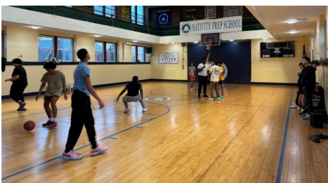
Young Alum Open Gym Night

The 8th grade is observing the solubility and reaction with iodine of different baking ingredients as a part of a unit-long chemistry lab.